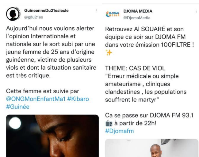
On the left, screenshot of the story published on 13 October 2021 by the Guineenne Du 21 Siècle collective. On the right, screenshot announcing a broadcast on the rape case

Amnesty International calls on the Guinean authorities to set up a toll-free number for victims to report cases of sexual violence, to be informed about their rights, how to access health and support services, including psychological and legal aspects.