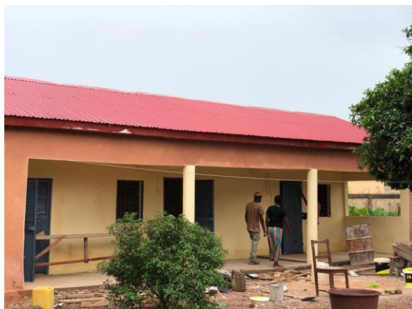
↑ Photo of the Solidarité Suisse Guinée refuge in Labé. Posted on 5 November 2021 on the NGO's Facebook page.

Amnesty International encourages the State to support the development of these one-stop centres throughout the country to increase the availability, quality and accessibility of specialised care, sexual and reproductive health, psychological and legal support services for victims of sexual violence.