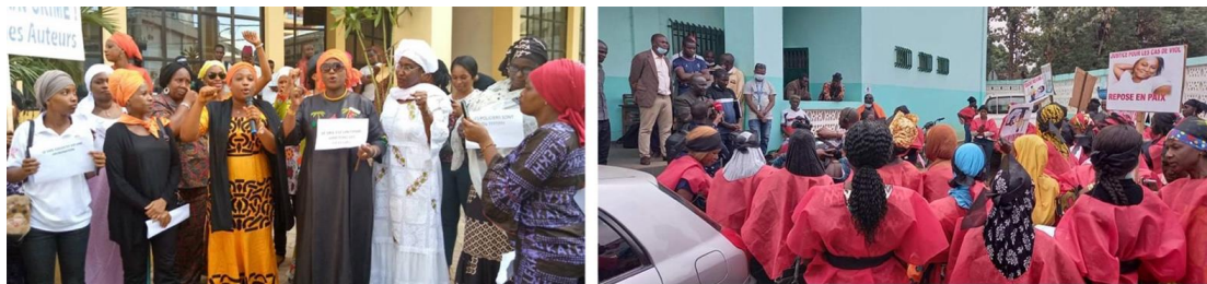
© ↑ Left, protest in front of the Department of Defence on 12 December 2019. Right, Protest in Nzérékoré on 30 November 2021 following the death of M'mah Sylla © Agir pour le Droit Féminin

The authorities reacted again to these tragic cases and to the mobilization of civil society. On 15 December 2021, the Prime Minister signed a “written commitment to end gender-based violence (GBV), including rape”. 54 This document also set a goal of reducing the rate of FGM by 10%. 55 The Minister of Security pledged that “the police will fight this scourge effectively and ensuring that the heaviest penalties will be applied to criminals who perpetrate these acts”. 56 Finally, on 13 January 2022, a memorandum from six national NGOs –forming the Women's Collective against Sexual and Obstetric Violence– was submitted to the Prime Minister, “calling on the authorities to scale up the fight against gender-based violence and the unconditional application of the law in order to punish these crimes of rape as well as harmful medical practices in our country”. 57 The Prime Minister assured the public at this time that “you will not find any barriers on our side, we are ready to listen to you and support you”. 58