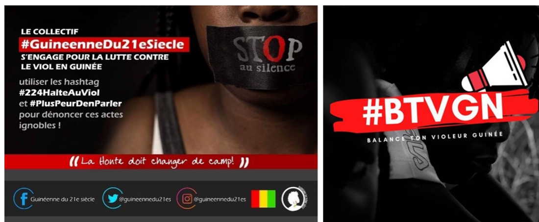
Artwork by the Guinéennes du 21e siècle collective for a campaign launched in 2017. Right, artwork for the Balance ton violeur Guinée campaign.