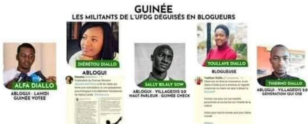
Montage of text and photos posted on social media presenting bloggers engaged in defending human rights as “undercover” UFDG activists

In addition, between 2019 and 2021, human rights defenders were often stigmatized, as were members of civil society and opposition parties, when they denounced human rights violations committed by the authorities, and they suffered severe repression: bans on demonstrations, protesters killed and arbitrary detentions. 179 In 2020 and 2021, communicators from the ruling RPG party tried to denounce “activists from the UFDG [the main opposition party] disguised as bloggers” and “UFDG supporters disguised as journalists” in text and photo montages (see below). The names and photos of some of them were published on social media along with screenshots of their posts supposedly proving their alleged sympathy for the opposition party. Among them were journalists and bloggers who had been involved in combating violence against women for several years, whether through the Association des blogueurs de Guinée (Ablogui), the Collectif guinéenne du 21e siècle aimed at “improving the conditions of Guinean life” 180 and the news website Guinée matin.org .