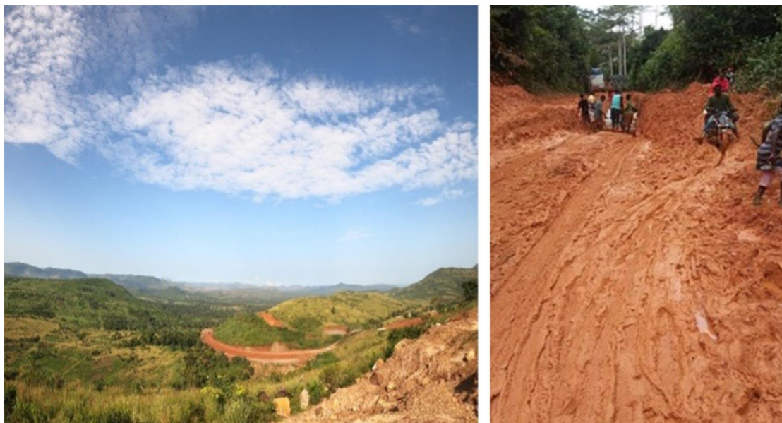
© ↑ On the left, a view of National Highway 1 (RN1) (November 2021) ©Amnesty International On the right, the road linking Guinea to Liberia in Nzérékoré region © Twitter account @ibrahimabiggy

This lack of resources can also result in some members of the security services asking victims' families to pay the costs of one or more parts of their job. The representative of an NGO fighting against sexual violence told Amnesty International: "Even the police want us to pay for transport, fuel. Once, we caught a rapist but had to pay for transport to go and apprehend him. It's because the police don't get paid. What do you want them to do?" 326