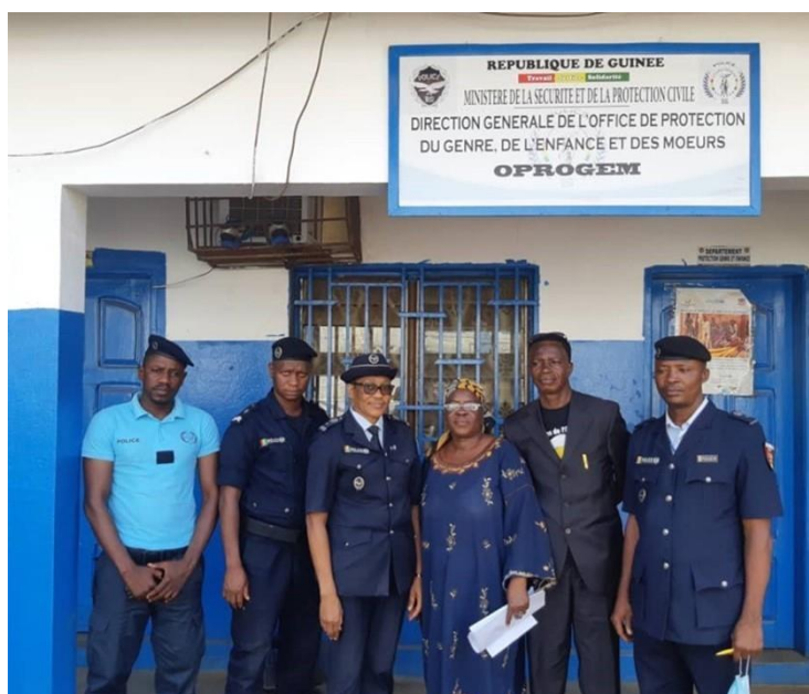
© The Oprogem General Management Team, 1 November 2021.