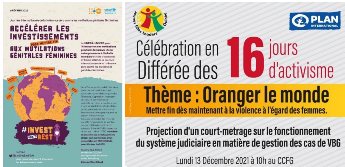
On the left, artwork shared via the Twitter account @unfpa_guinea on 18 January 2022 in the run-up to the International Day of Zero Tolerance against Female Genital Mutilation. On the right, artwork distributed on social media on the occasion of the 16 days of Activism against gender-based violence.

and for 8 March, International Women's Day. These campaigns often combine a variety of awareness-raising tools such as public speaking engagements, artistic and sports performances, film screenings 129 and awards. 130